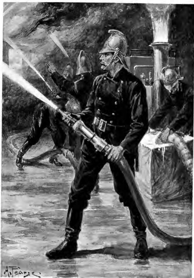
LONDON TYPES: THE FIREMAN.