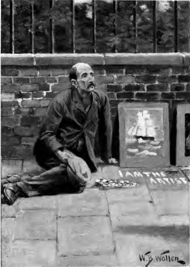
LONDON TYPES: THE PAVEMENT ARTIST.