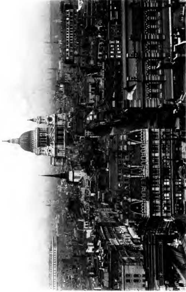
ST. PAUL'S CATHEDRAL FROM THE TOWER OF ST. BRIGIDES.