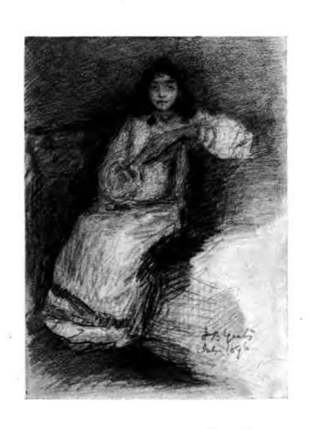
Saww Kain _