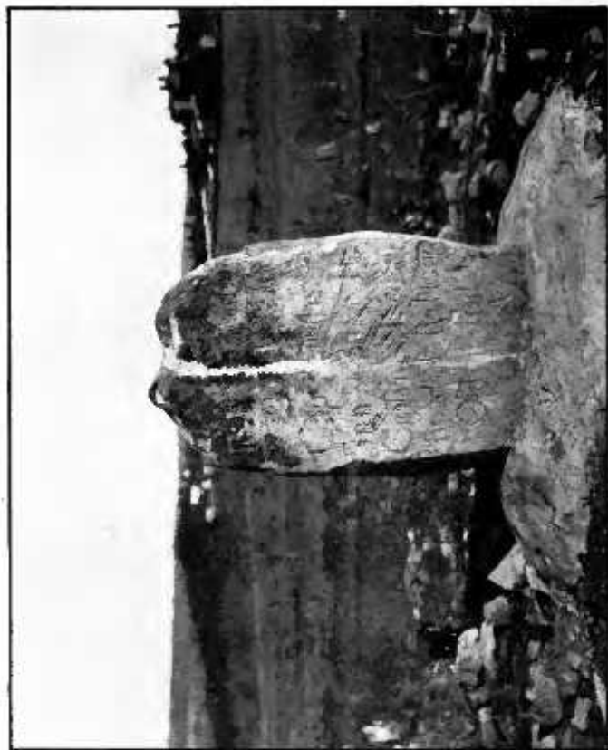
A MILESTONE ON BRADDOCK'S ROAD [See page 205, note 20]