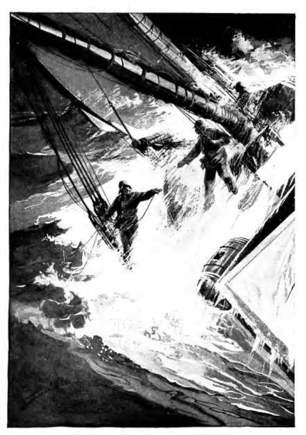
"That's one end of the stays'l halliards."