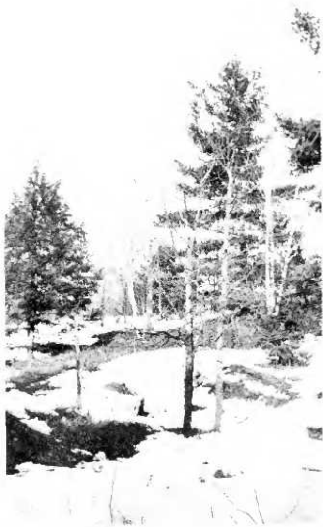
"THROUGH PATCHES OF SNOW"