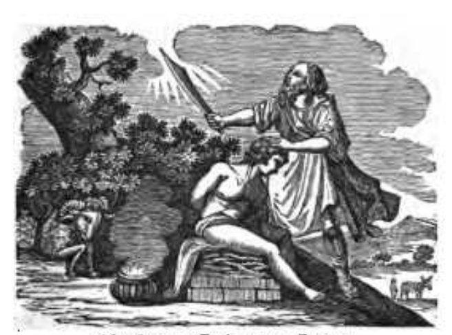
Abrehem offering up Issec.