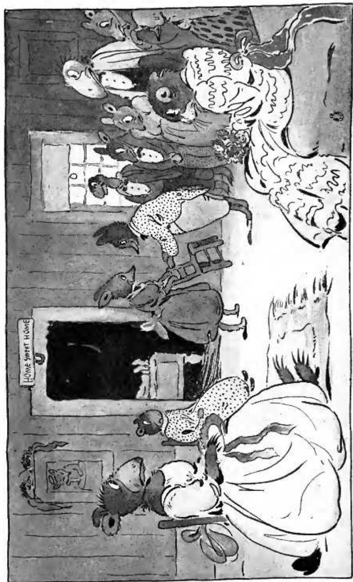
Mis' Fox Gin 'Em Cheers