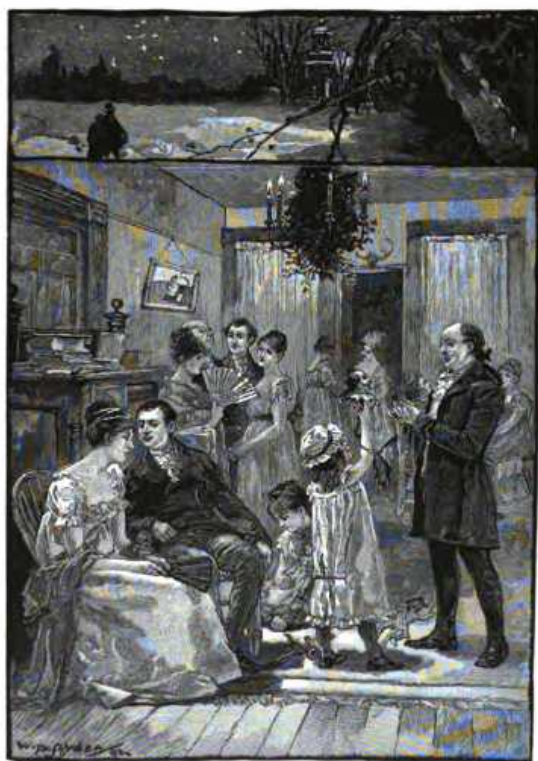
"Christmas, merry Christmas."