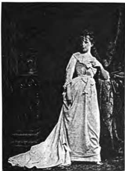
THE LAST PHOTOGRAPH OF MARIE BASHKIRTSEFF.