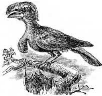
UMBRELLA CHATTERER.—Page 156.