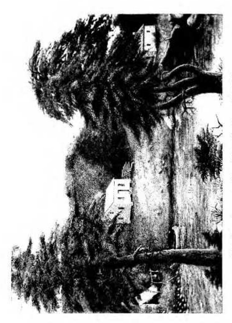
First frame house in Grand Rapids, Erected 1833 by Joel Guild. Present location of the National City Bank