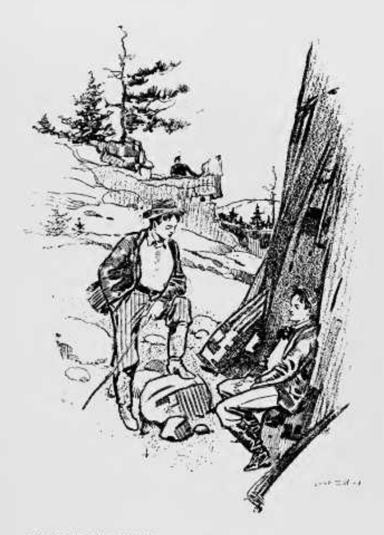
THE HEAD AND SHOULDERS OF A MAN INTENTLY STUDYING THEM