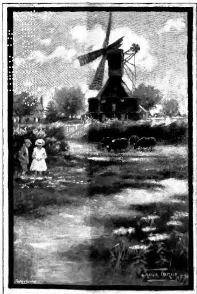
A HAUNT OF PERCE.