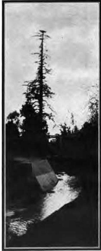
THE PALO ALTO TREE