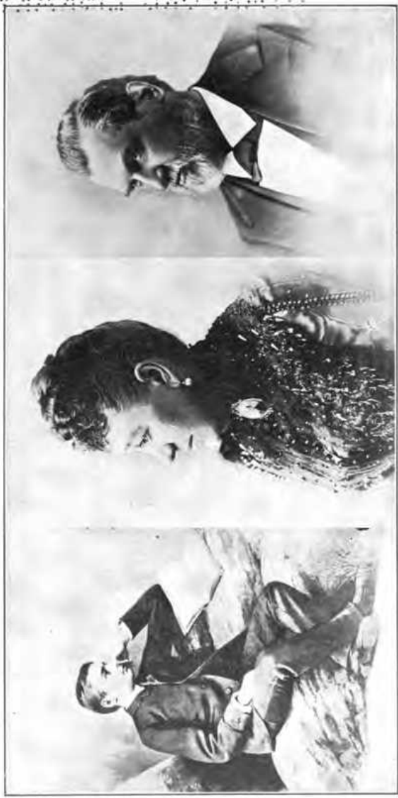
LELAND STANFORD JUNIOR