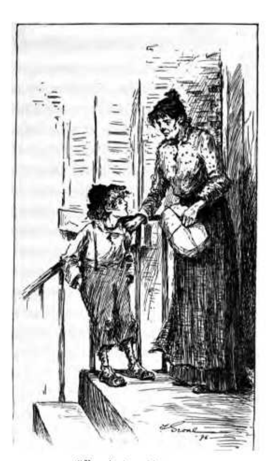
"You take this and hock it."