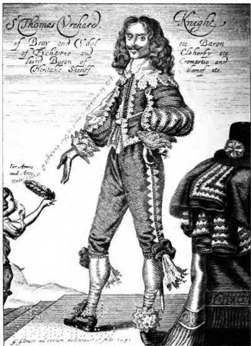
SIR THOMAS URQUHART.