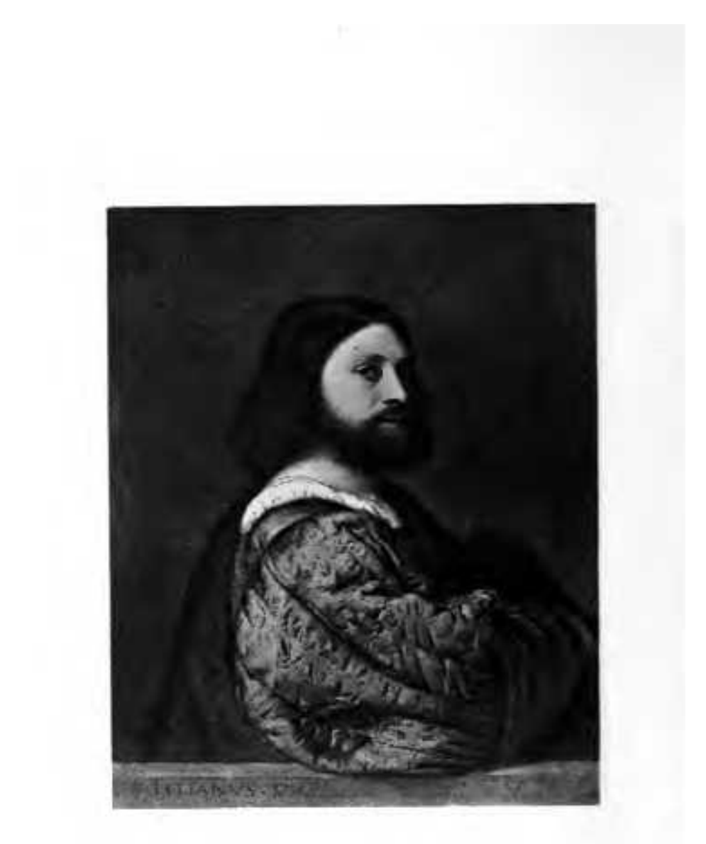
TITIAN: ARIOSTO The National Gallery, London