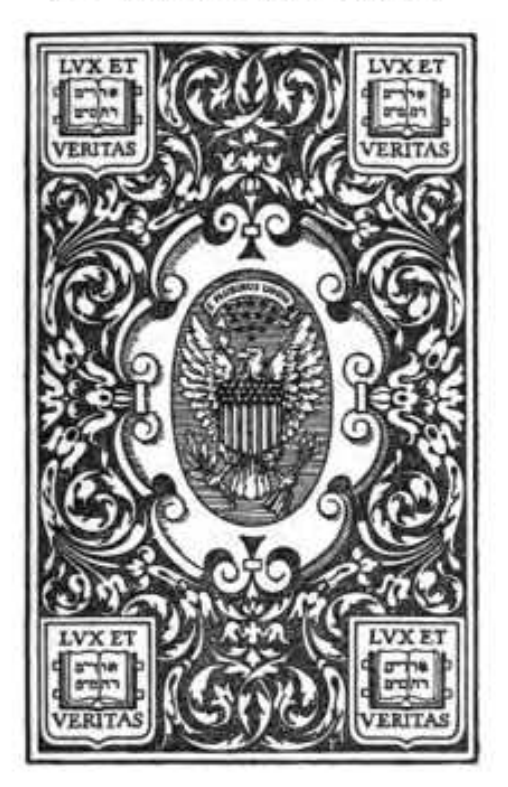
NEW HAVEN: YALE UNIVERSITY PRESS TOBONTO: GLASGOW, BROOK & CO. LONDON: HUMPHREY MILFORD OXFORD UNIVERSITY PRESS