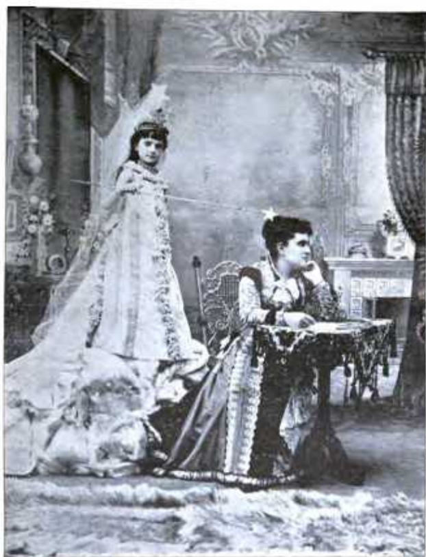
The Fairy Queen about to inspire the Author.