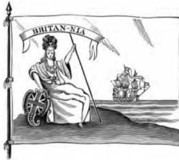
"CAMP COLOUR. BORN AT THE SIEGE OF LOUISBOURG, 1745. EXPEDITION UNDER SIR WILLIAM PEPPERELL. PRESENTED TO THE NEW YORK HISTORICAL SOCIETY BY JOHN STARK." A FAC-SIMILE OF THE ORIGINAL, MADE BY PERMISSION FOR THE SOCIETY OF COLONIAL WARS IN THE STATE OF NEW YORK.