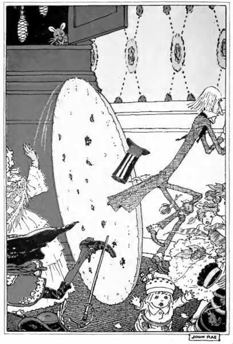
"Here! what's this rolling across the floor?" (Page 142)