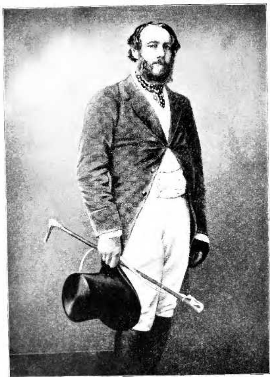
CHARLES CECIL JOHN, SIXTH DUKE OF RUTLAND.