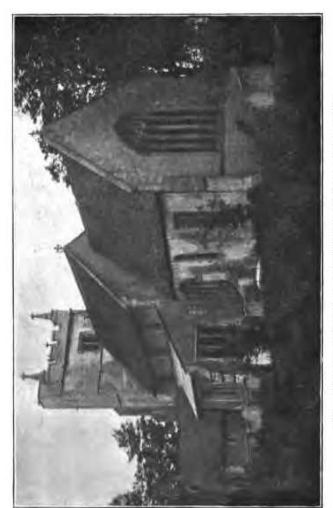
South-east View of Wicken Parish Church: Dedicated to St. Lawrence.