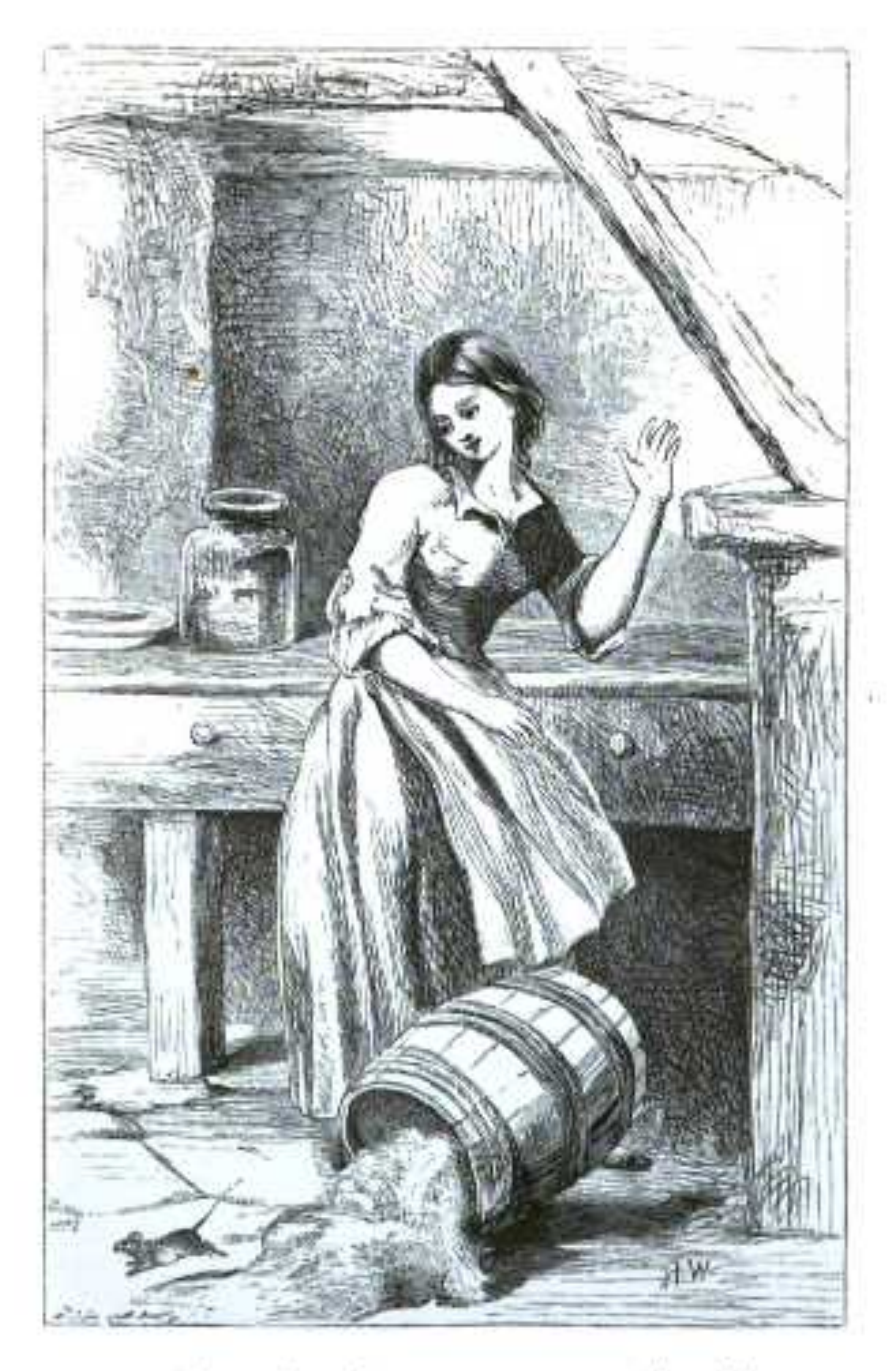
Susan exclaimed, "O, grandfalber, there's a messel" and lesiantly let the tub fall on the finer.—P. 98.