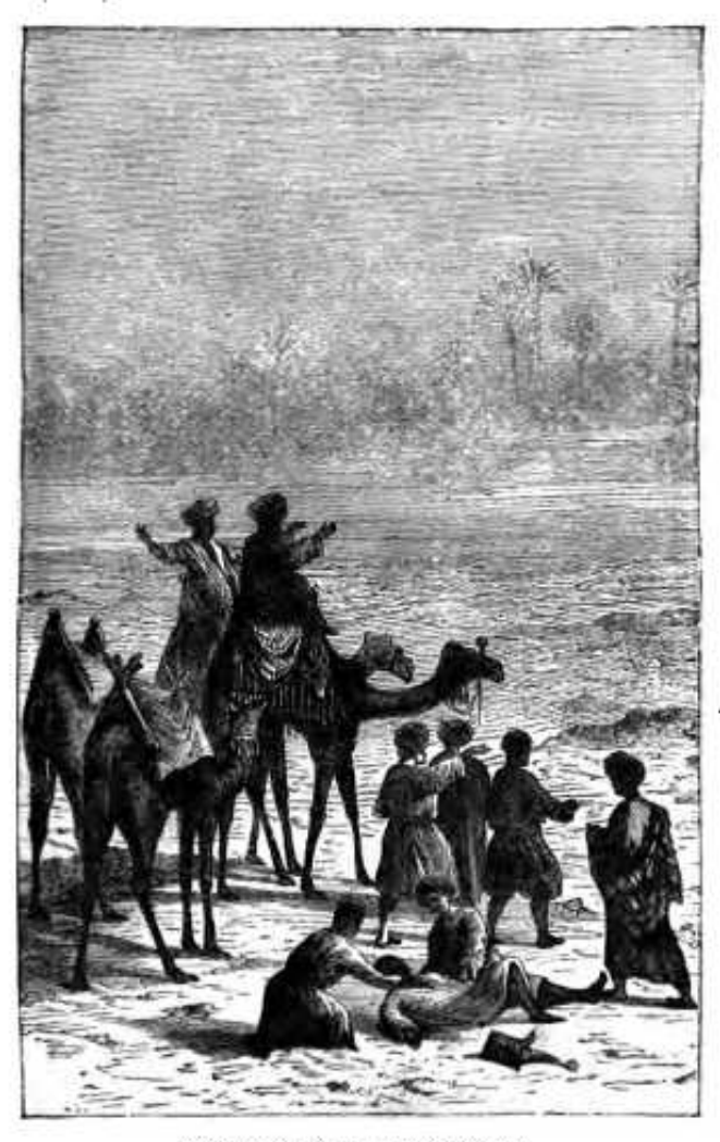
THE MIRAGE OF THE DESERT.