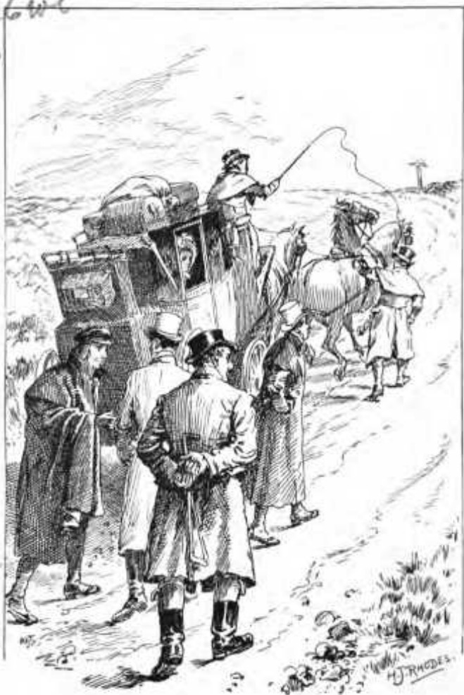
HE HELD HIMSELF A LITTLE ALOOF FROM HIS TRAVELLING COMPANIONS.—A. 75.