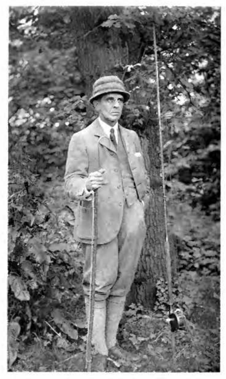
THE AUTHOR.