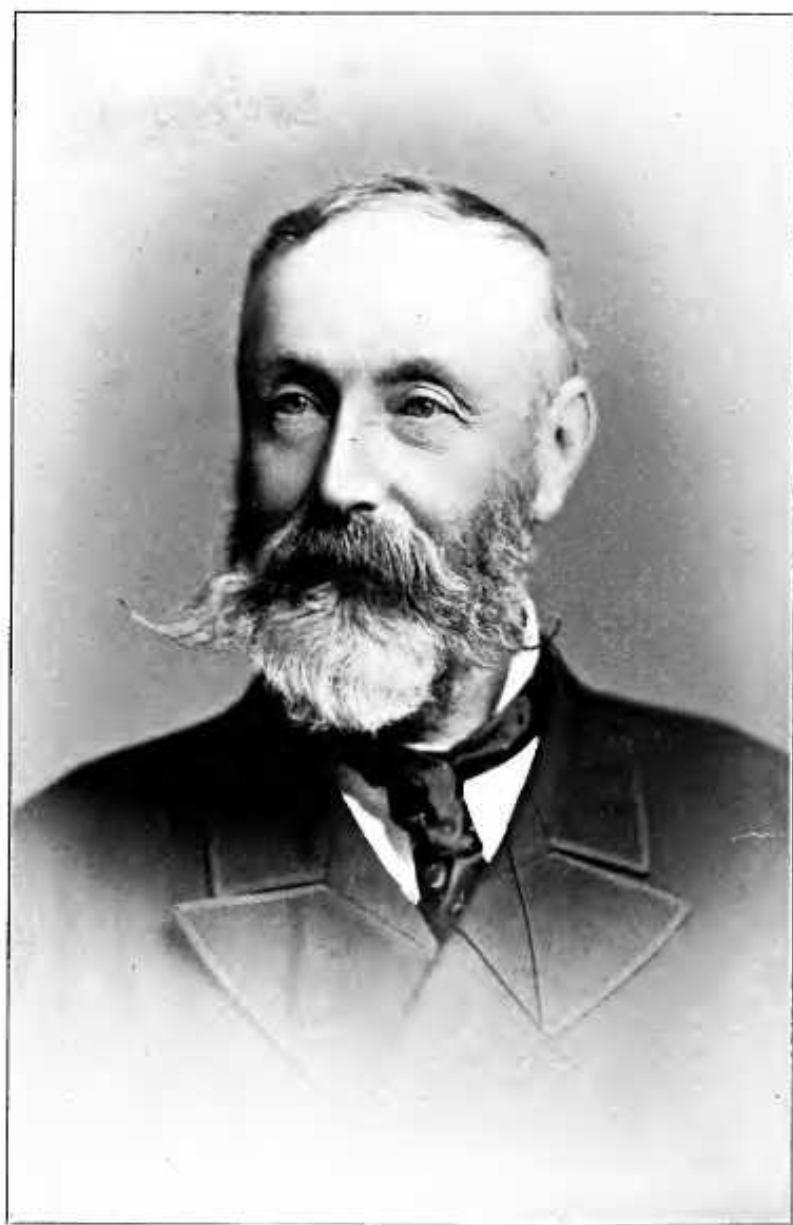
HON. FRANCIS ORMOND.