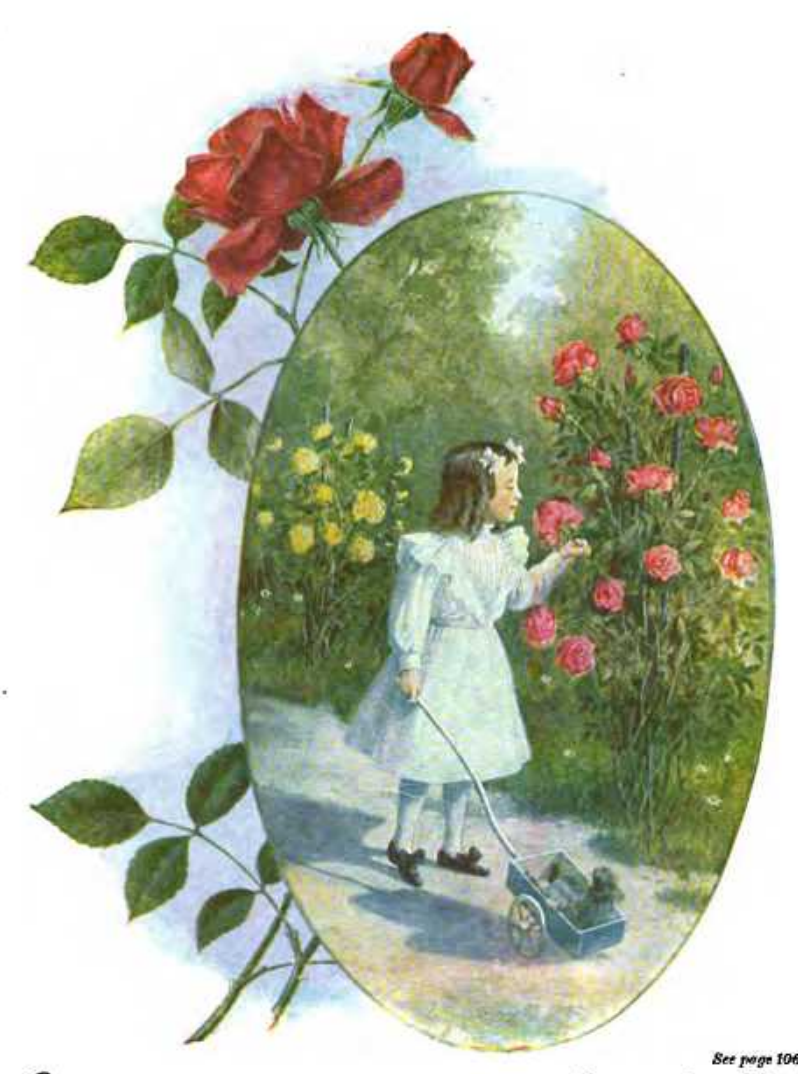
Good morrow, pretty Rosebush!