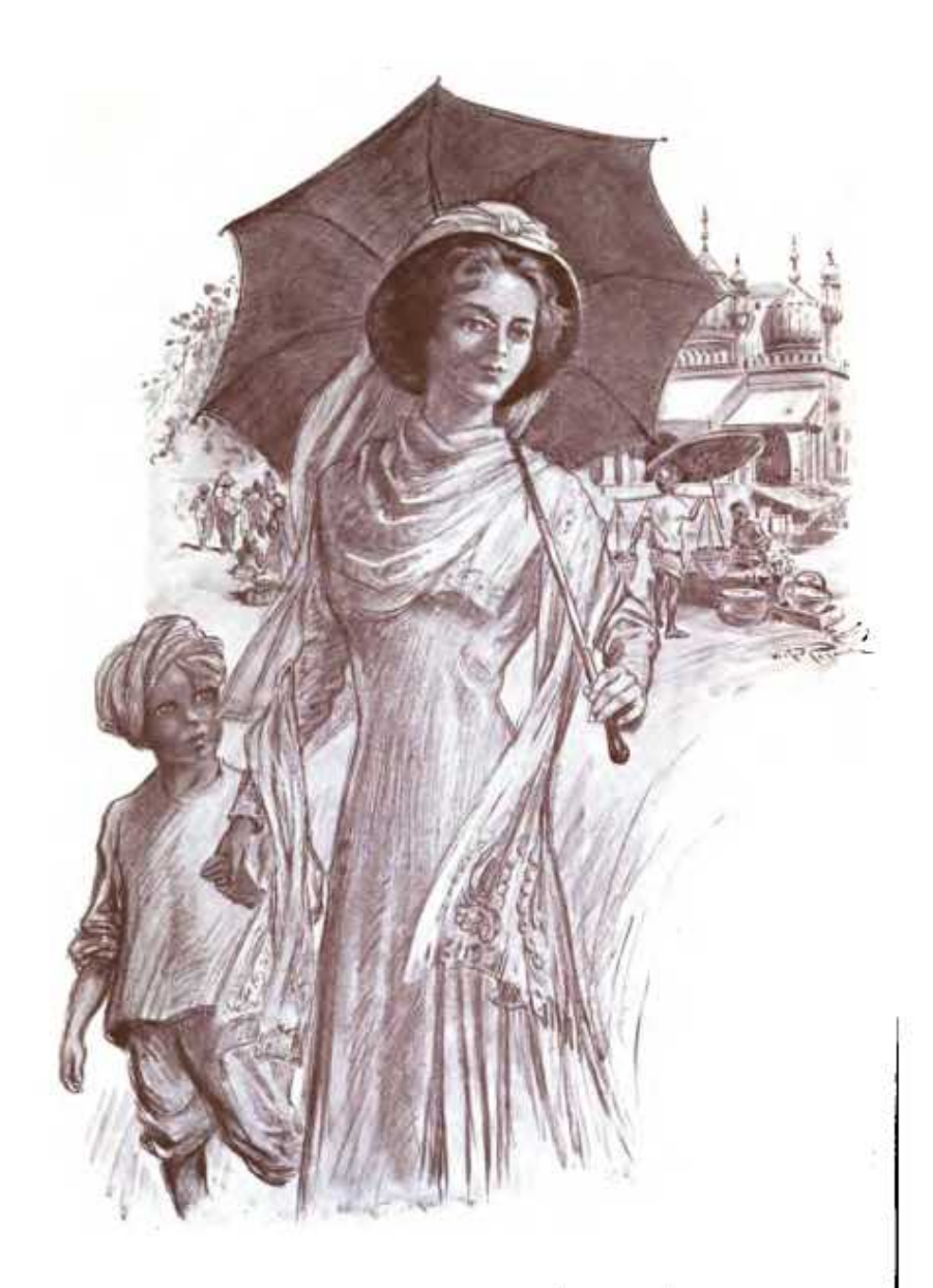
harmon et é gent transce (1