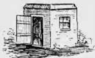
MISS HATTIE BOSMER'S STUDIO IN WATER- TOWN, MASS., IN 1854. See page 25.