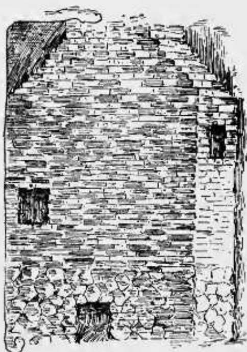
THE GREAT CHIMNEY