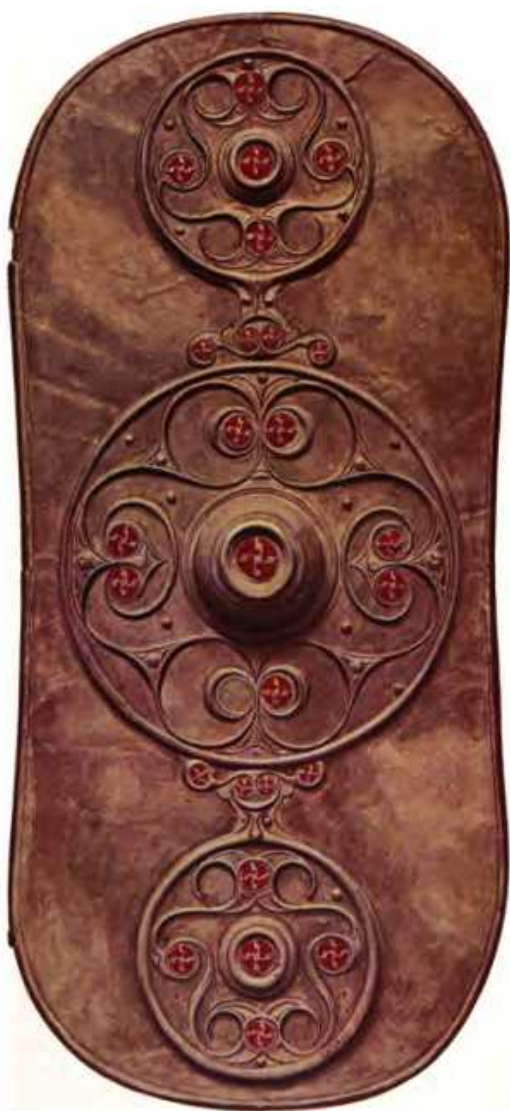
PLATE I. ENAMELLED BRONZE SHIELD, THAMIS AT BATTERSEA ( \frac{1}{2} ).