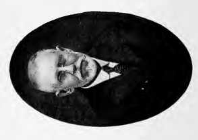
AND WHEN RELEASED.