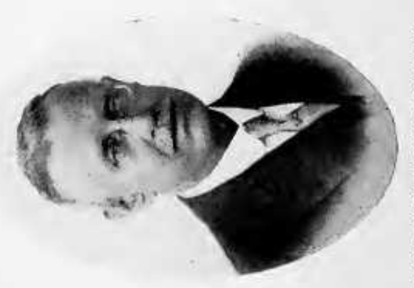
THE AUTHOR BEFORE CAPTIVITY