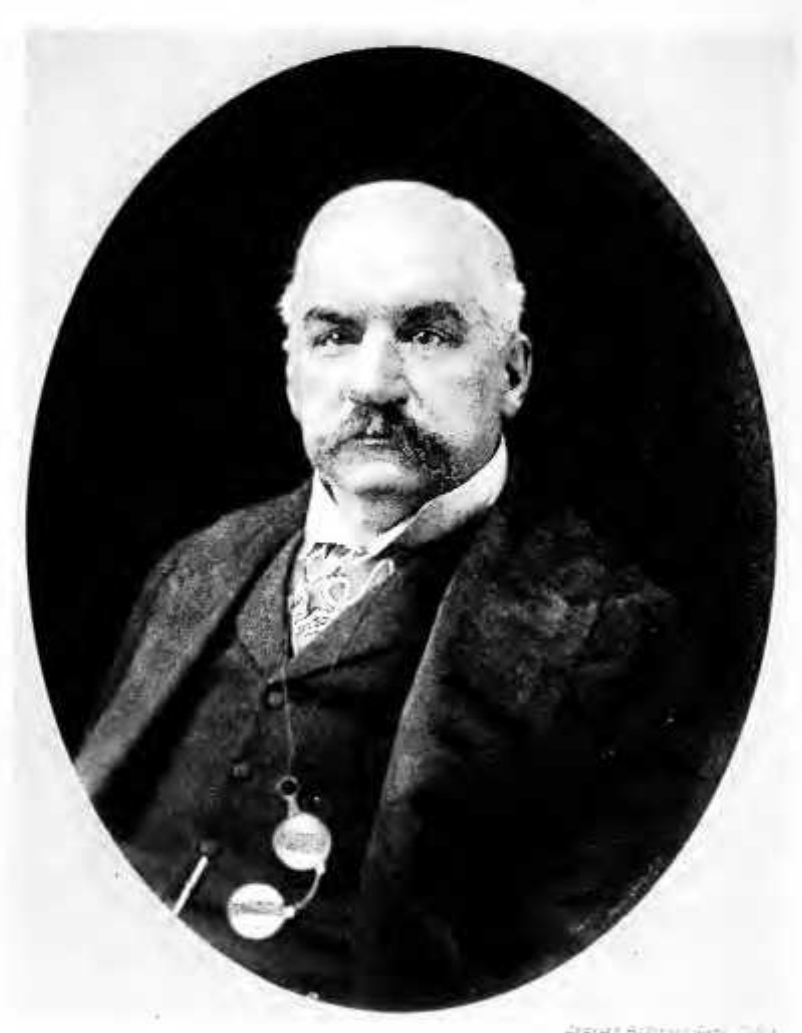
Appears Actions Saw