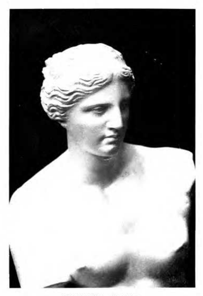
THE YEXUS OF MILO.