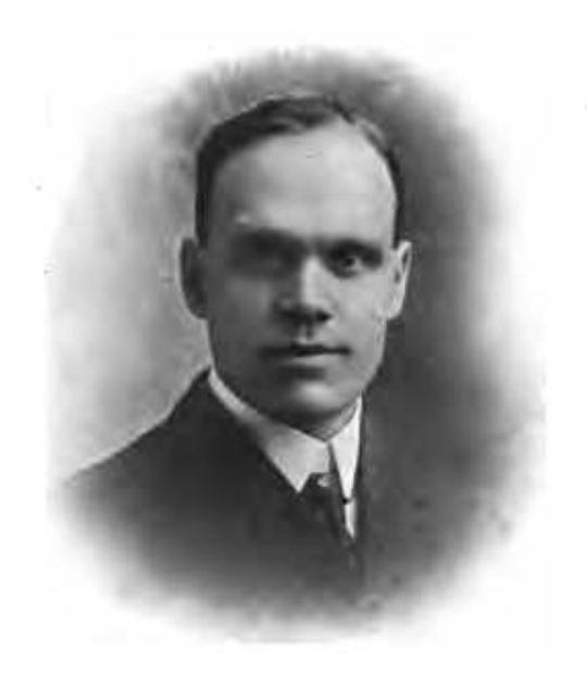
Cordially Hw. Pen