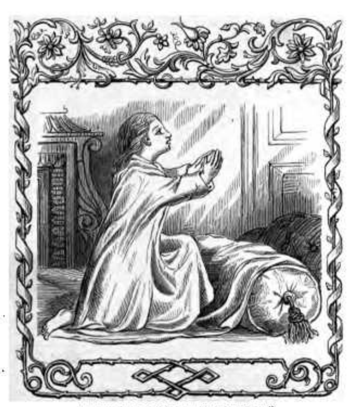
"SPEAK, LORD, FOR THY SERVANY HEARETH."