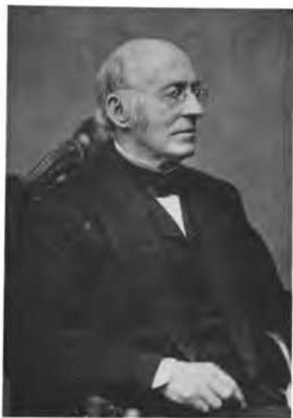
Wm. Lloyd Garrison.