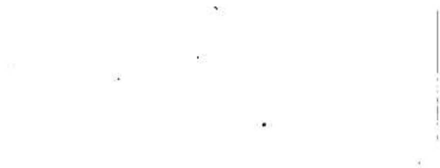
Figure 1. Relationship between the number of nodes and the number of edges for a tree structure.

where n is the number of nodes, m is the number of edges, and h is the height of the tree. The number of nodes in a tree is given by the following equation: