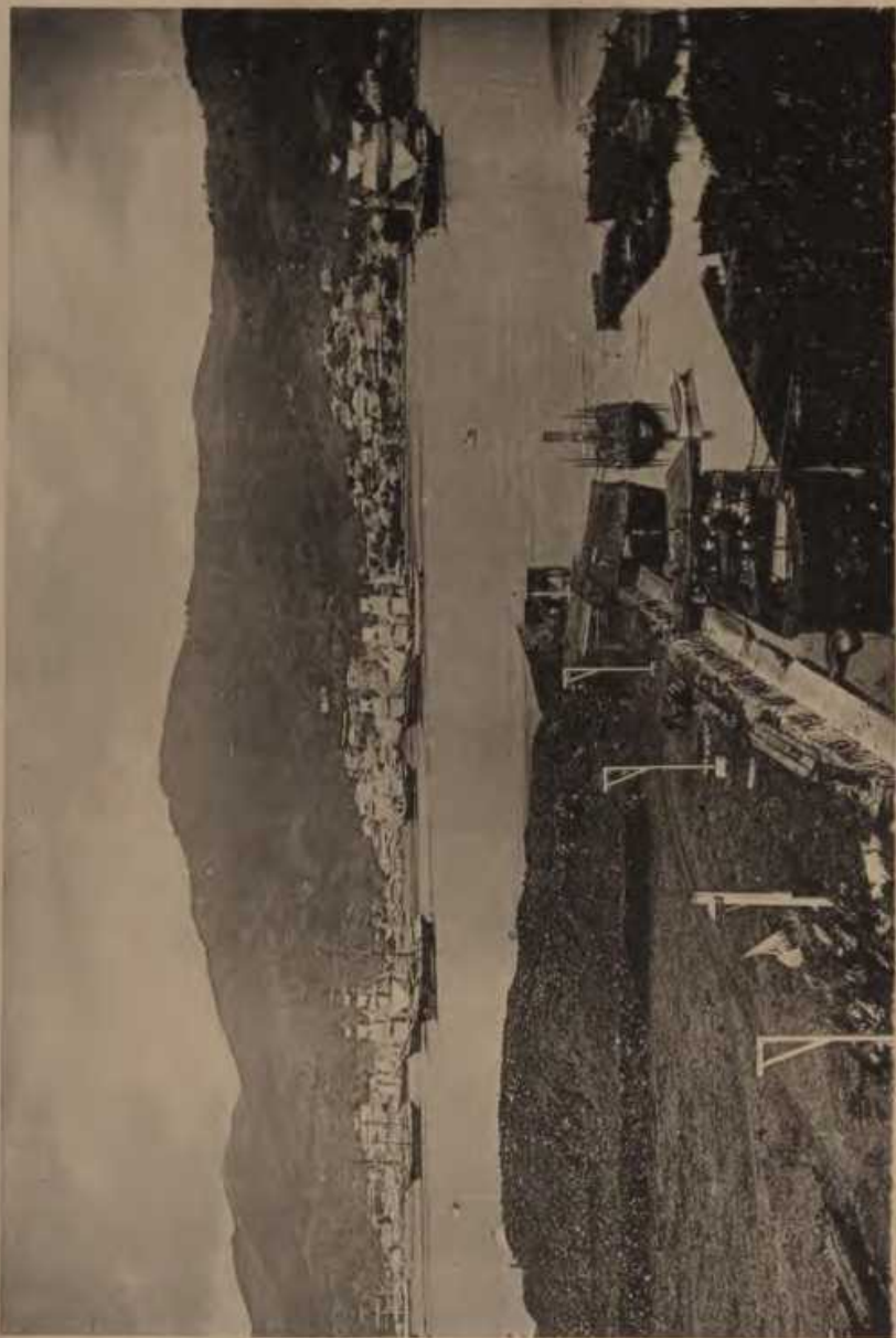
TOWN AND HARBOUR OF ST. THOMAS, D. W. I.