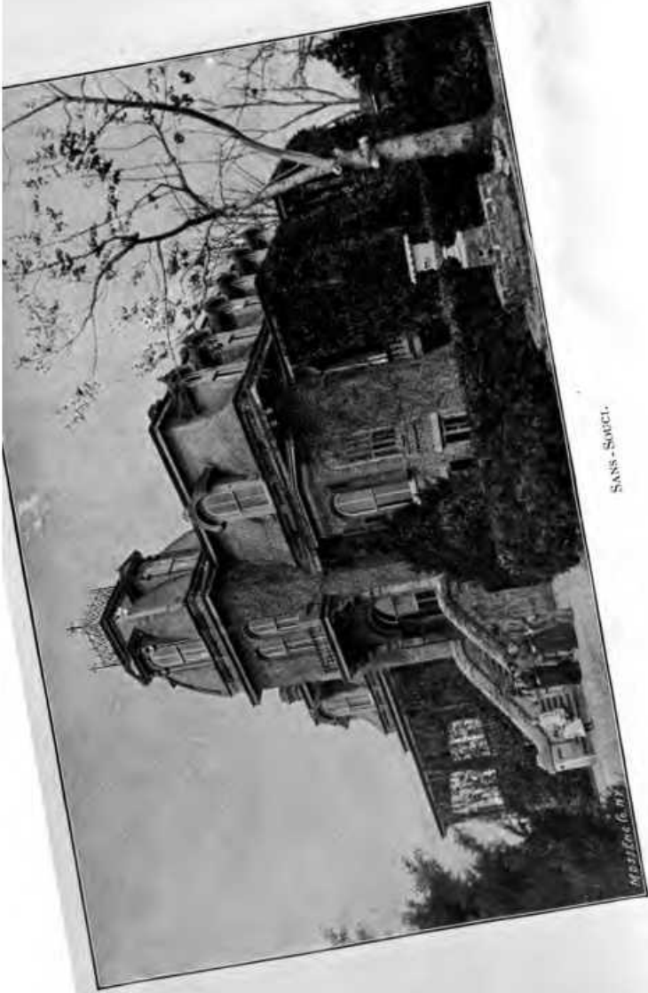
SANS - SOCIÉTÉ.