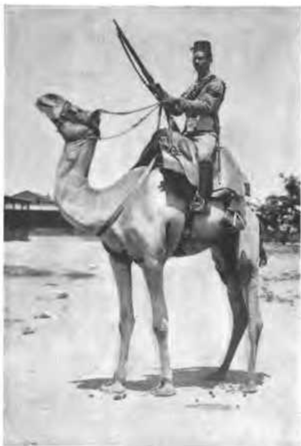
ONE OF THE CAMEL CORPS OF EGYPT