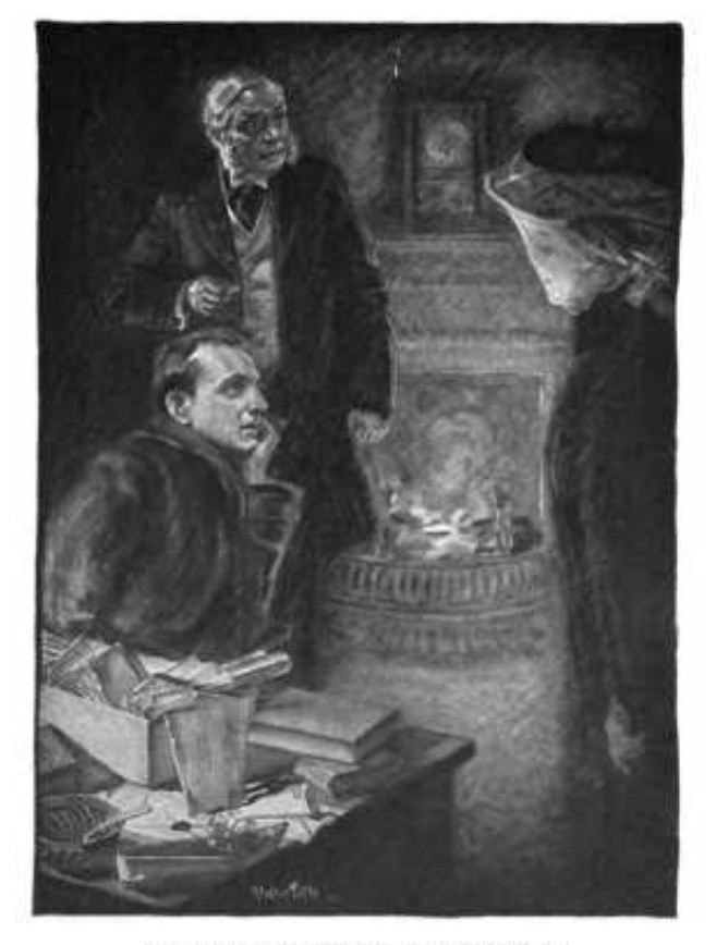
The so-called delicious, intangible joke