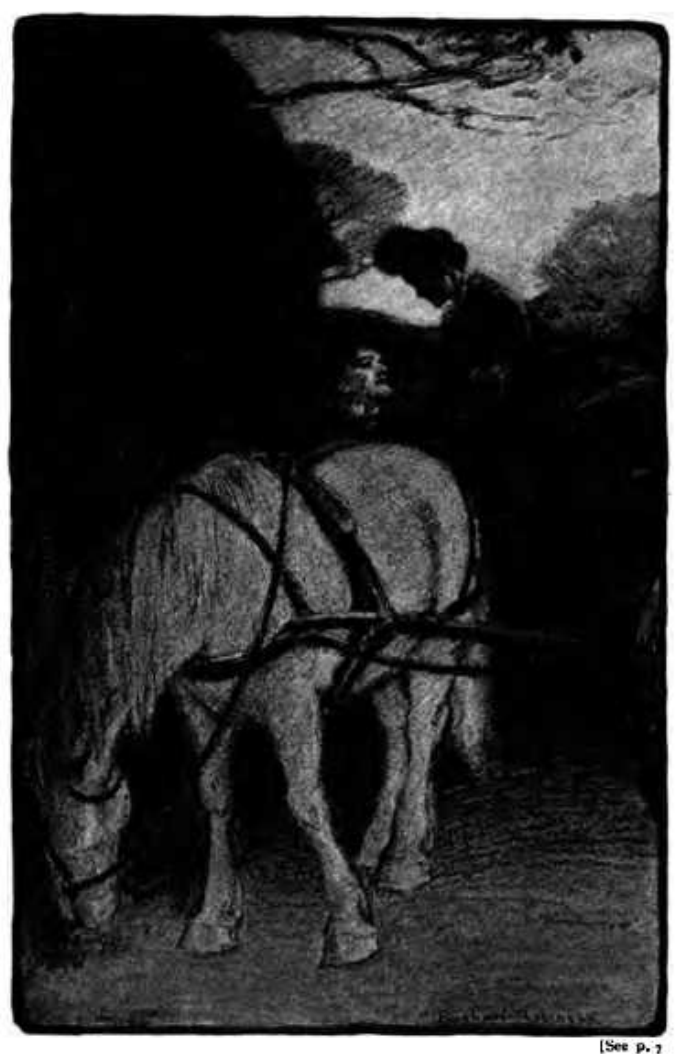
WHEN DAVIE BROUGHT ELISABETH HOME IT WAS IN THE SPRING AND AT SUNSET