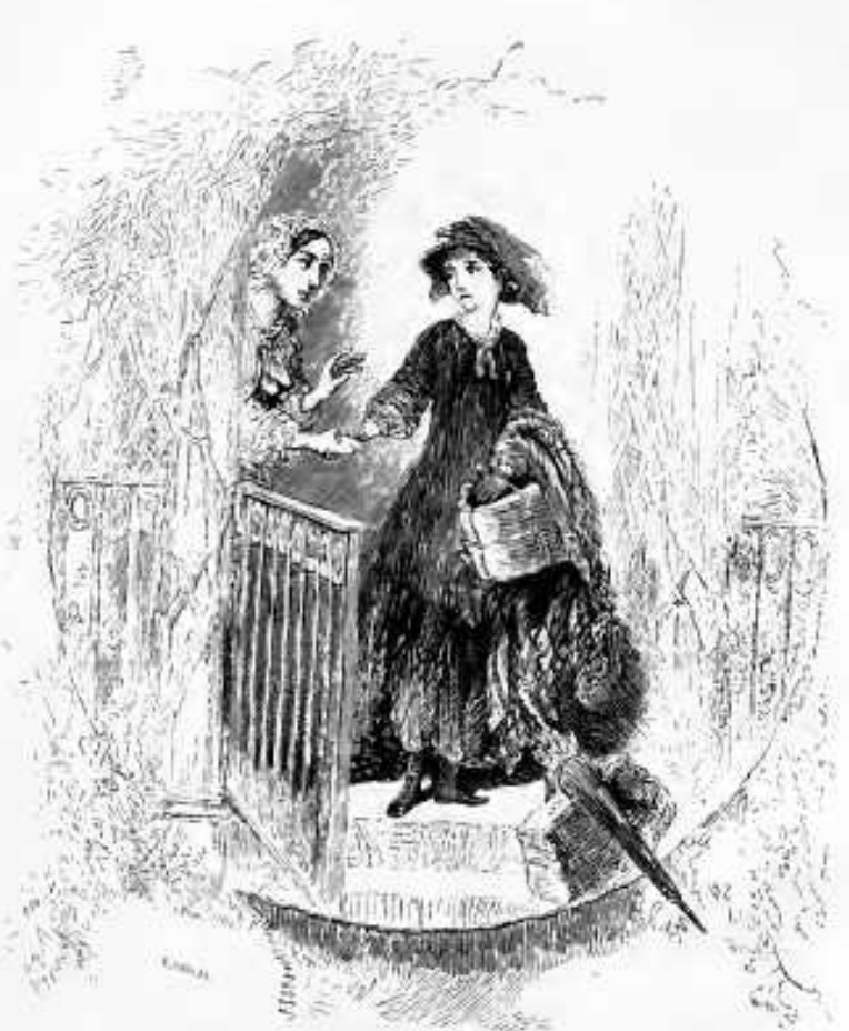
" Good-bye, mother; n.w don't you fret about me at all."