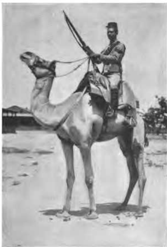
ONE OF THE CAMEL CORPS OF EGYPT