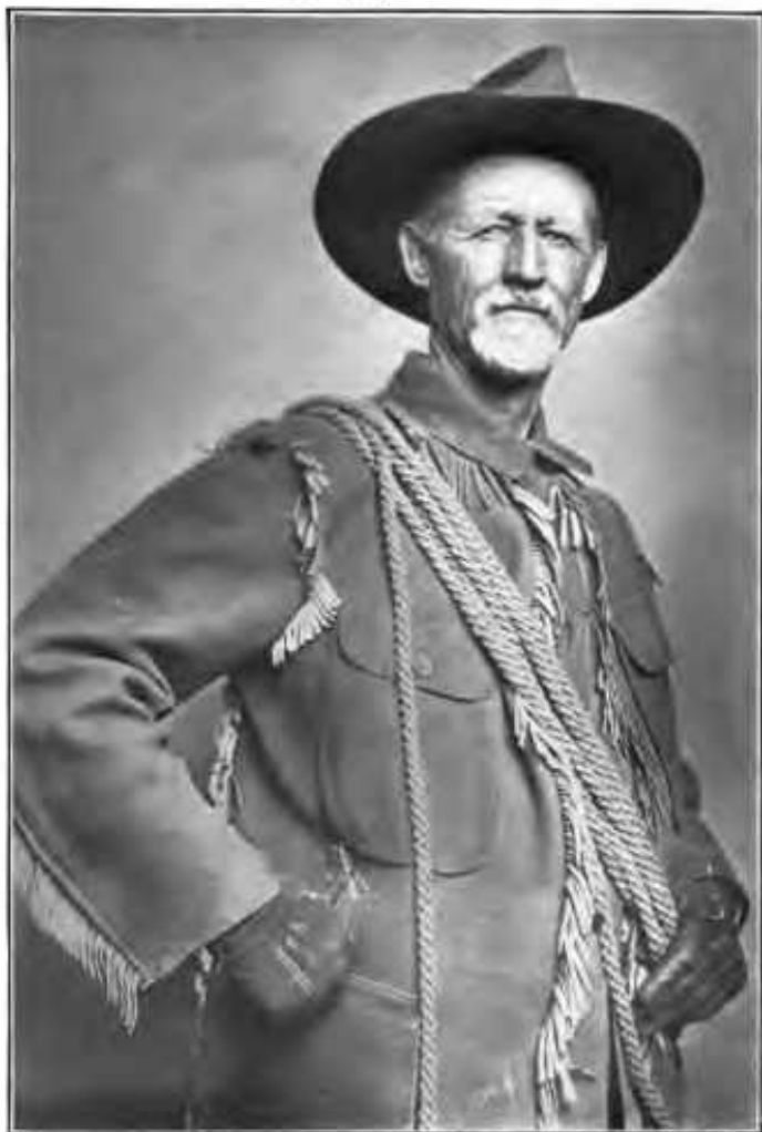
COLONEL C. J. JONES (BUFFALO JONES)