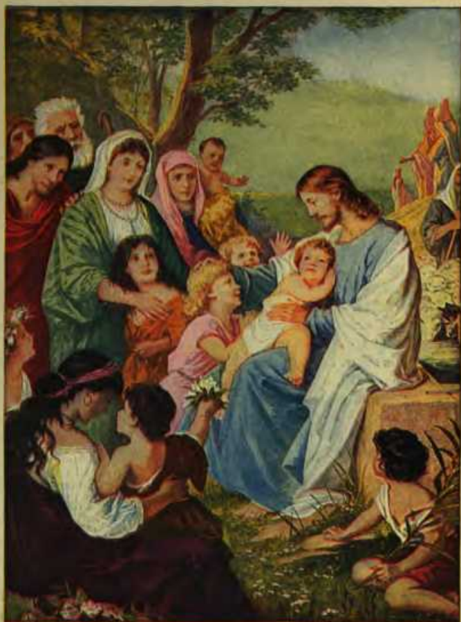
Painting by Flockhurst