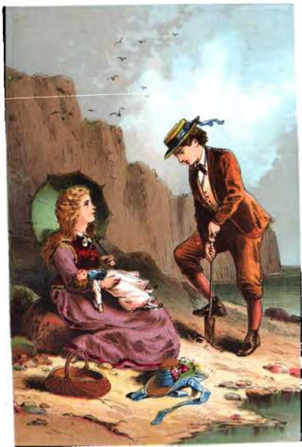
THE CHILDREN AT HASTINGS Page 320