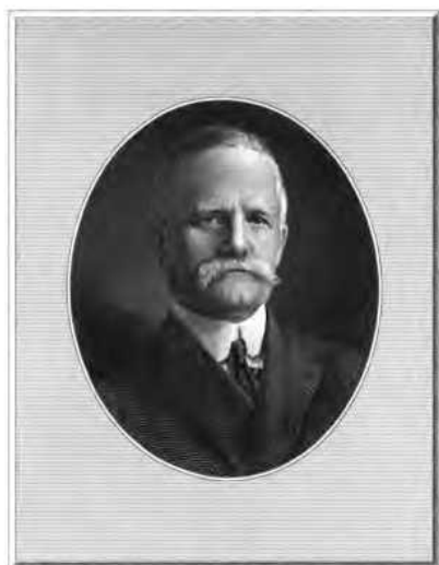
W. H. H. H. H. H.